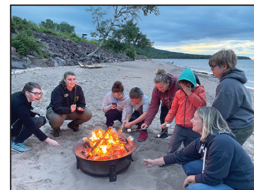
Enjoying Lake Superior Day 2023